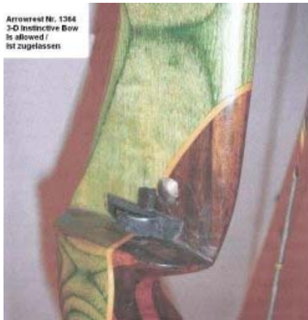
1364: Is allowed

Article 11.10.3.2.2.2 reads: Either no arrow rest is used or only a simple arrow rest without pressure-button and without overdraw can be used.