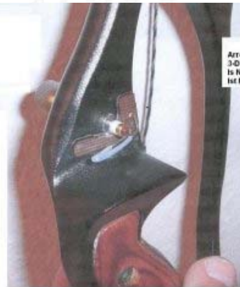
1360: not allowed